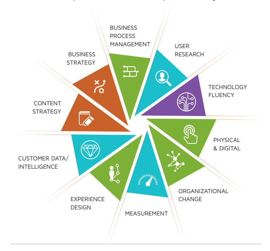
Figure 2 The Ten Core Competencies for Customer Experience Management

bring all resources to bear on 100% of projects. Within the CEM ecosystem, a diverse pool of service specialists is available to help address the challenges. Service providers with specific niche expertise, vendors' professional services teams, digital agencies, and systems integrators are all viable options. Choosing a partner with the right expertise and capabilities is more important than the type of firm it is. The right service provider(s) can be the difference between an implementation's success and failure, or the difference between getting the project done quickly and having it drag on unnecessarily. Making better use of service providers is, in fact, a key recommendation emerging from our research.